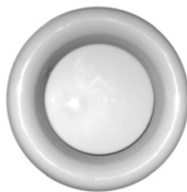
Circular Ceiling Valve

DO NOT adjust the ceiling valves - The valves are set to allow a certain amount of air through and should not be adjusted.